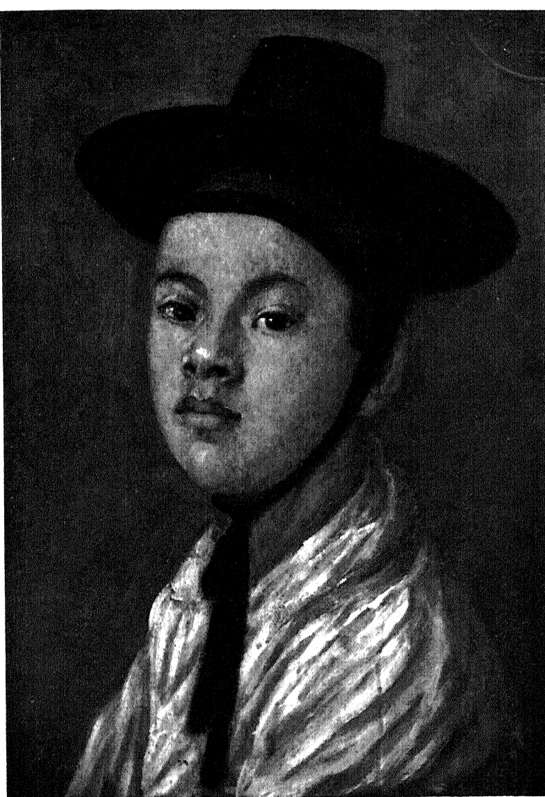
YOUNG MARRIED MAN. Page 13.