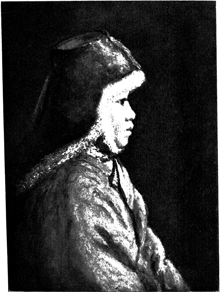
KOREAN GIRL IN WINTER DRESS. Page 39.