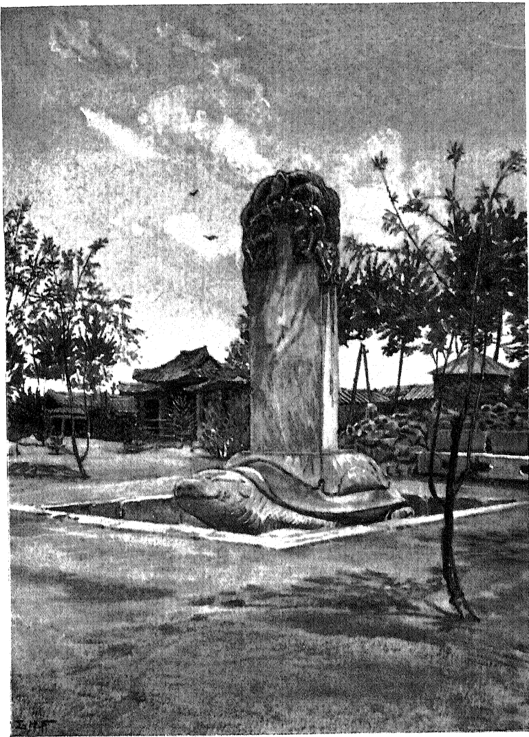
MONUMENT WITH TORTOISE PEDESTAL IN THE PUBLIC GARDENS, SEOUL