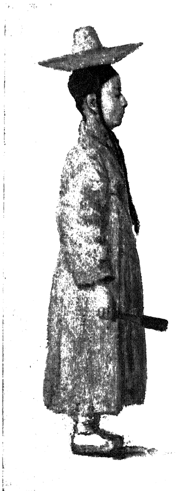
A KOREAN BRIDEGROOM. Page 3.