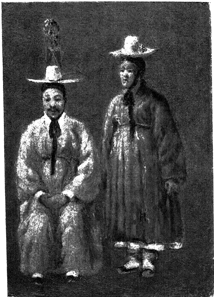
SERVANTS OF THE EMPEROR